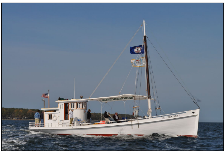
1. The F.D. Crockett was listed in the National Register in 2012.

Photographs are one of the key components of a nomination to the Virginia Landmarks Register and the National Register of Historic Places. Without photos, a nomination cannot be considered final and a property will not be listed in the Registers even if all other pieces of the nomination packet are complete. The photos that accompany a nomination are meant to provide an overview of the historic property's current condition and to demonstrate that the nominated property has the characteristics necessary for listing in the Registers.<sup>1</sup>