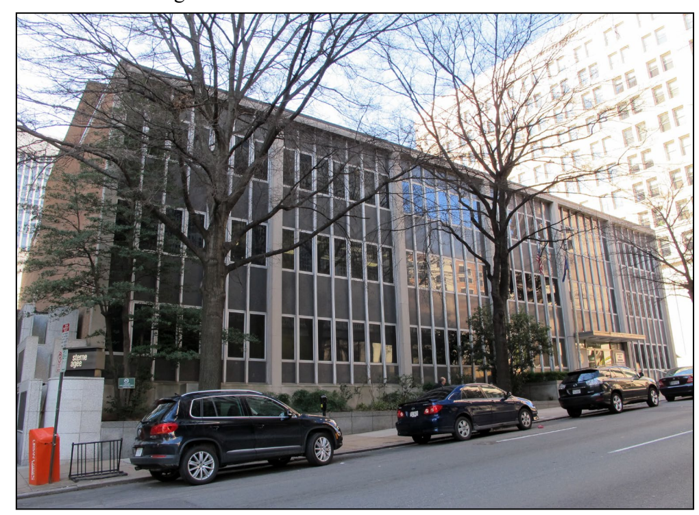
4. Located at 703 Main Street, this building was included in the 2013 Boundary Increase to the Main Street Banking Historic District in Richmond.

• In the photo log, include the photograph's view (e.g., primary dwelling, east elevation) and direction (e.g., camera facing east).