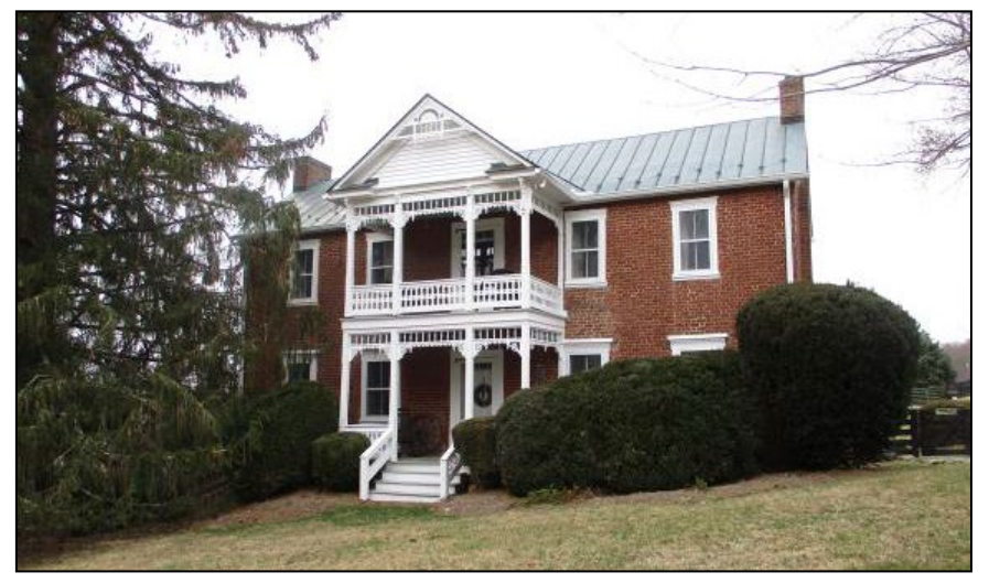
Figure 5. Bellevue, in Craig County, was listed in the Registers in 2020.

If your computer is equipped with a disc burner, you can burn the image files to a CD and include that with the rest of your nomination materials. You also may be able to have a photo CD created by a commercial photo lab; as CDs fall out of use, this may become more difficult to do. But if you use a disc created by a commercial lab, you are not required to rename the files. That disc may be submitted as received from the lab.