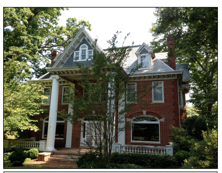
2. Dulwich Manor was listed in the National Register in 2013.